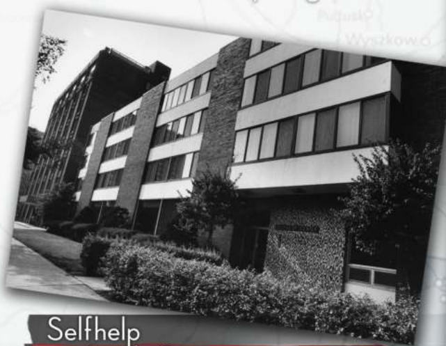
Selfhelp on Argyle Street