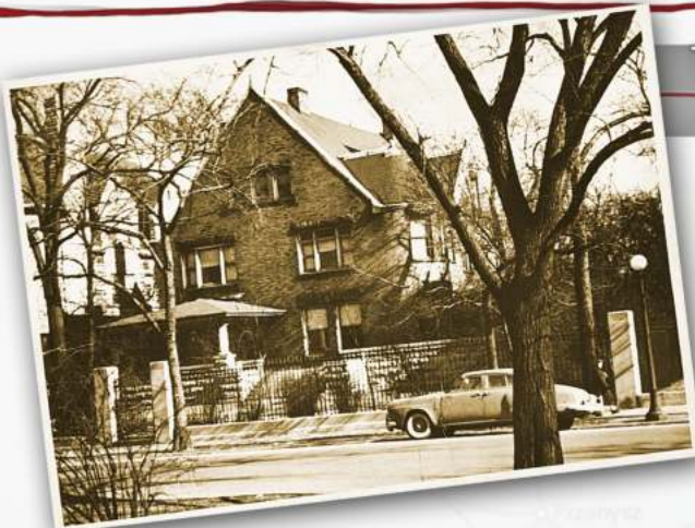
The first Selfhelp Home on Drexel Avenue